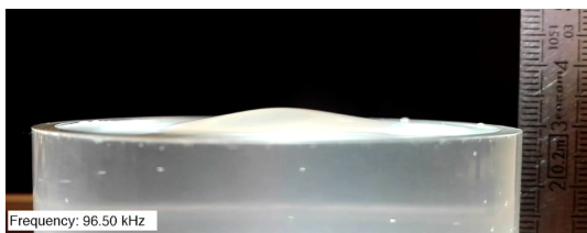
FIG1: Shape change of a water/air interface by the acoustic radiation force.

An interface between two elastic media can be deformed by the force of acoustic radiation [1,2] (see: Figure 1). When this non-linear effect is controlled and optimized, it is possible to develop complex devices for wave control, such as an acoustic diode or an acoustic transistor [3]. Recent scientific advances have made possible to create metasurfaces that allow exotic control of acoustic wave propagation. These new materials pave the way for new functionalities such as frequency converters [4] or wavefront modulators [5].